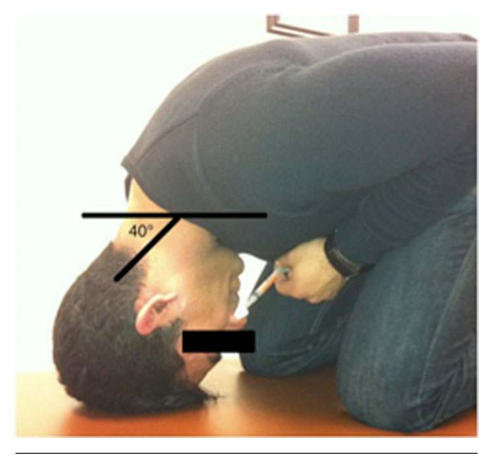
FIGURE 2. HDF position angled to approximately 40 degrees below the horizontal plane. HDF = head-down and forward.

noethmoid recess, and nasopharynx) were captured. The right paranasal sinuses were first to receive the fluorescein spray for all specimens included. Once the procedure was completed on the right side, the head was reoriented to the alternative head position and the left paranasal sinuses received the fluorescein nasal spray. To prevent retrograde regurgitation of the dye, the sinus cavities were vigorously rinsed with normal saline and excess dye was removed from the endoscope with an alcohol swab, prior to spraying the opposite paranasal sinuses. Sinus cavities were visualized to confirm the dye was removed. These procedures were standardized for all specimens. Blinded evaluation of all captured images was conducted independently by 3 rhinologists (A.R.J., E.C.G., and A.V.T.) to determine the