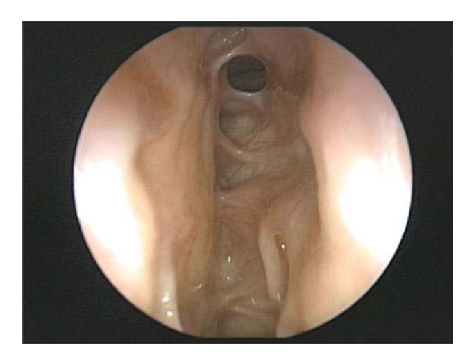
Fig. 1 Post-operative view of frontal ostium 1 month after endoscopic frontal sinusotomy

The operative approach utilised at our centres for frontal sinusotomy is along the lines of the Messerklinger technique-minimally invasive and with meticulous preservation of mucosa. For this purpose the key instruments at our disposal include a 70° Karl Storz reverse-post endoscope, a variety of refined instruments including Huweiser/Kuhn frontal through-cut instruments (45 and 90° with various angled tips), frontal sinus seekers with various angles and tips (Karl Storz), frontal sinus giraffe forceps (45 and 90), as well as angled suction curettes and mushroom punches. We also double bend our suctions so that we have maximum access to the excessively angled frontal recess [12]. Alongside these the GE Instatrak 3500+ image guidance software is employed for all cases of frontal sinusotomy to ensure that any frontal recess cells such as Kuhn type 1-3 cells, supra-orbital ethmoid cells and intersinus septal cells are cleared to allow adequate drainage of the frontal sinus. Post-operative results show excellent aeration of the frontal sinus as seen in Fig. 1 in the majority of cases. Table 1 demonstrates the recurrence rates from our recent study showing a recurrence in frontal sinusitis of 19% in the group of patients who underwent their primary surgery at