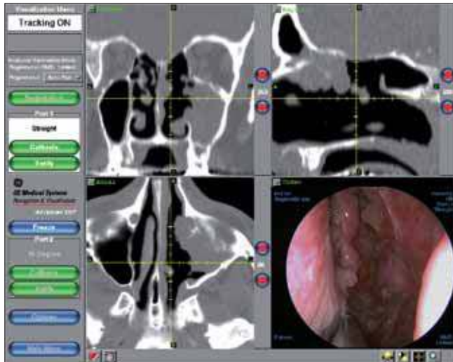
Figure 1. Endoscopic and image guidance software view of multifocal recurrence of an inverted papilloma.

ing an open procedure (2 at revision, 1 prior to treatment at St Paul’s Hospital). In this early cohort only 4 patients with recurrences were primary resections; the remaining recurrences occurred in patients (n = 14) who had had their initial surgery elsewhere (78%). Other noteworthy findings were that 2 patients had 5 revisions between them, 2 died of other causes before revision and 2 patients did not have revisions due to medical co-morbidity. From the 23 non-recurrences, 13 patients had their primary surgery elsewhere (56%). The difference in the rate for primary surgery versus revision surgery was not however significant (p = 0.27). The morbidity for these IPs is summarised in Table 2.